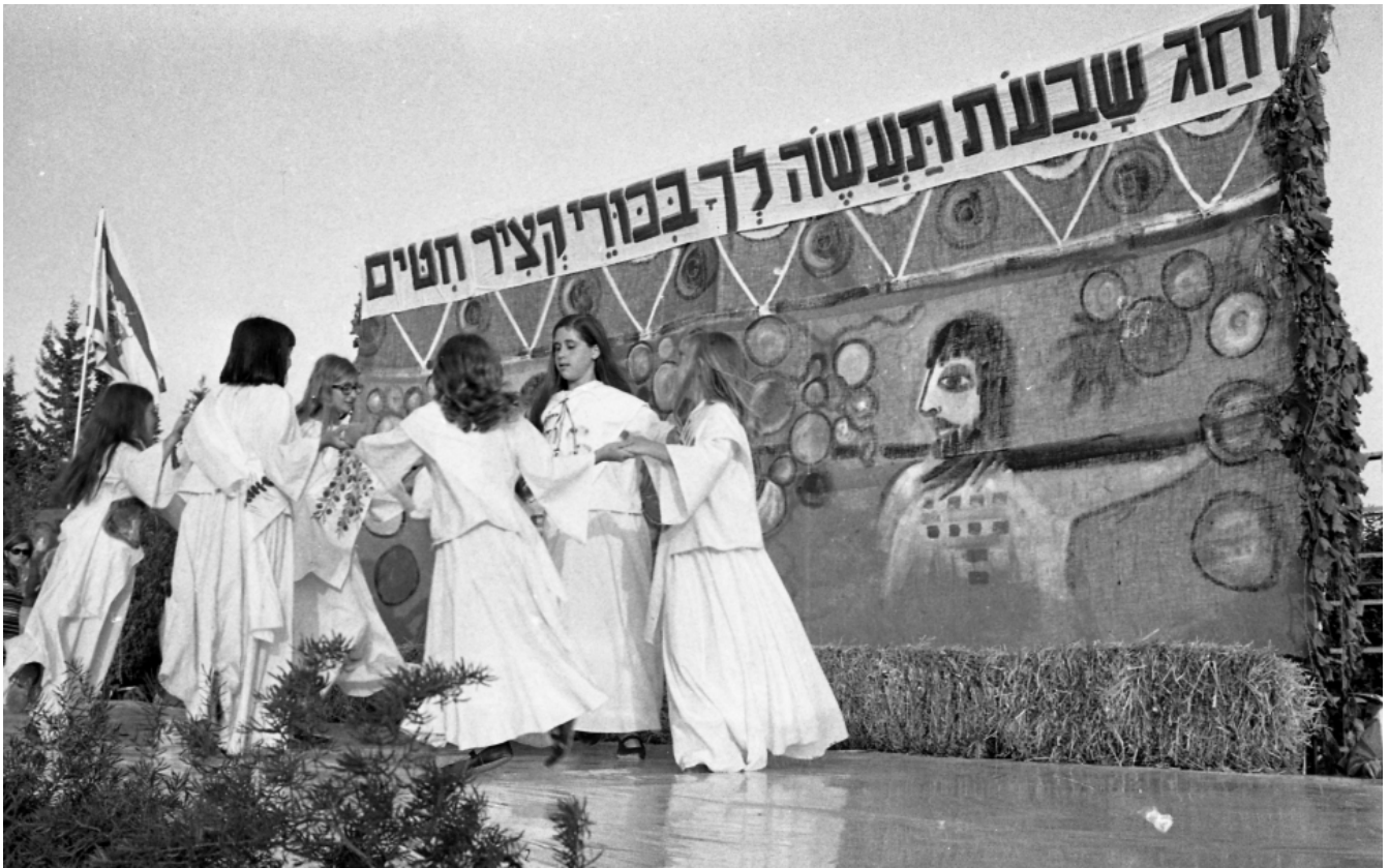
Girls Dancing in Shavuot Ceremony, Tel Aviv, 1970