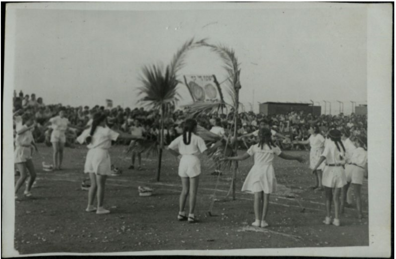
Shavuot in Cyprus, 1940s