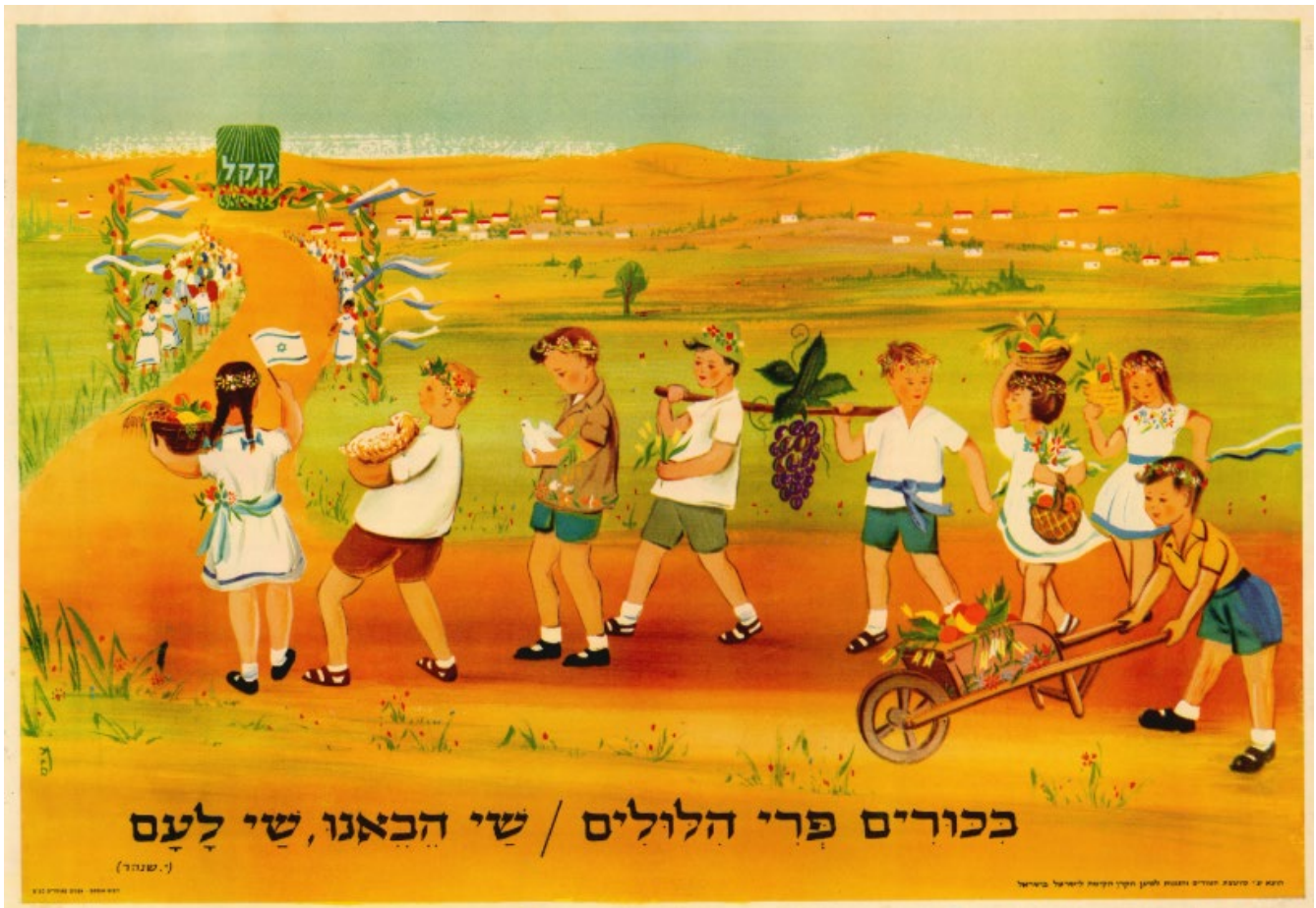
Bikkurim, JNF Poster Ephemera Collection, The National Library of Israel