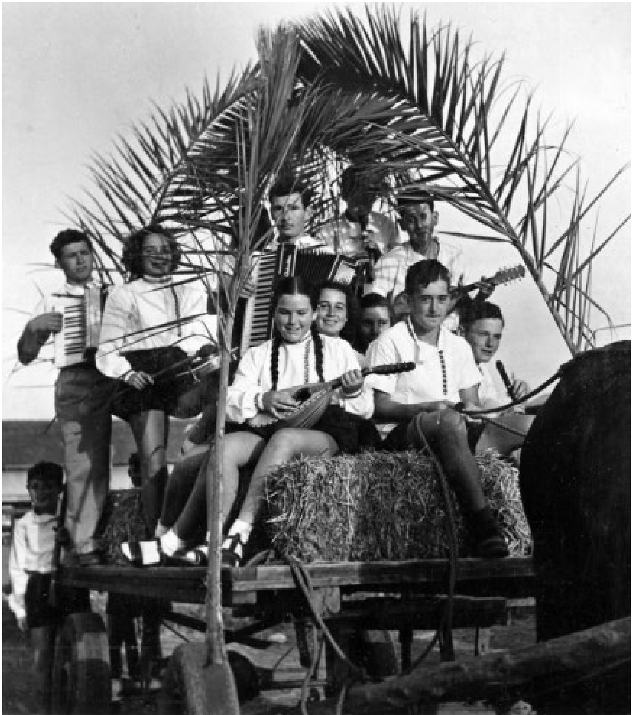
Bikkurim Celebration, Twentieth Century