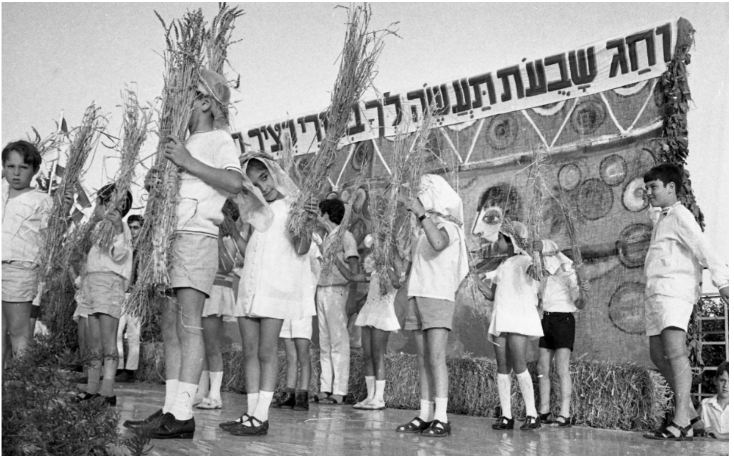
Children Participating in a Play at a Shavuot Celebration, Tel Aviv, 1970