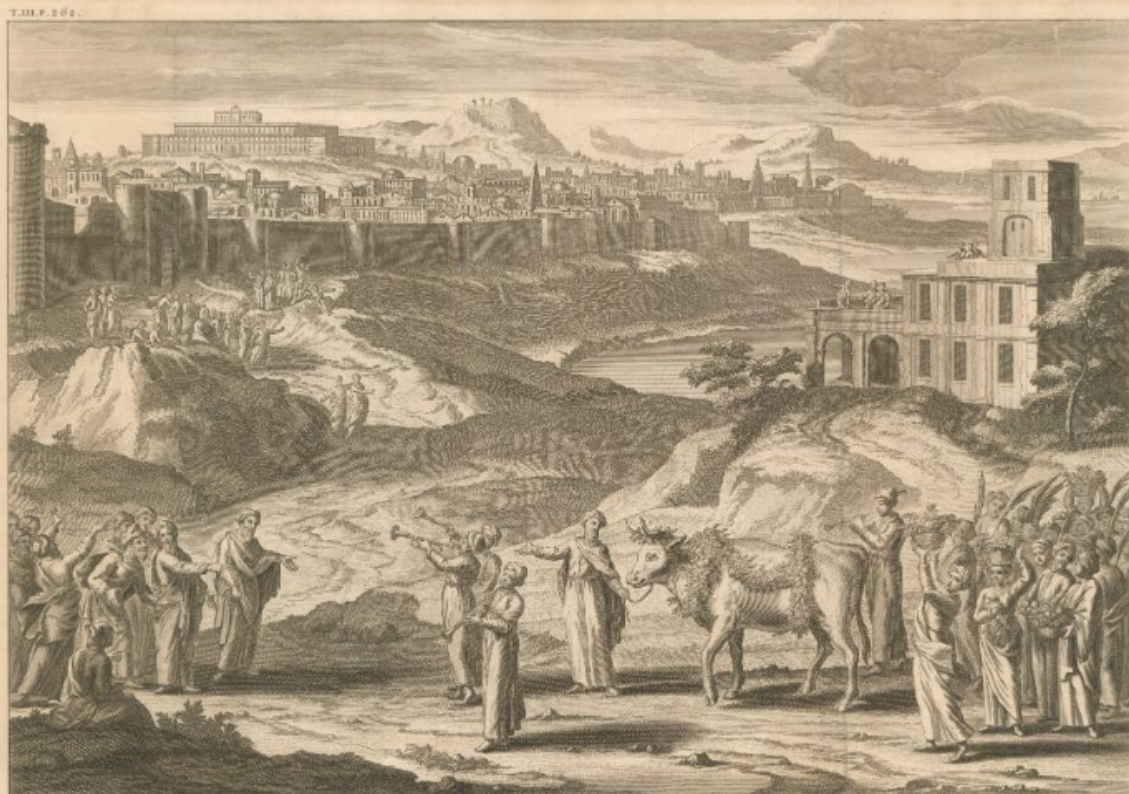
GRANDES DES PREMICES PORTÉES AU TEMPLE DE JERUSALEM.