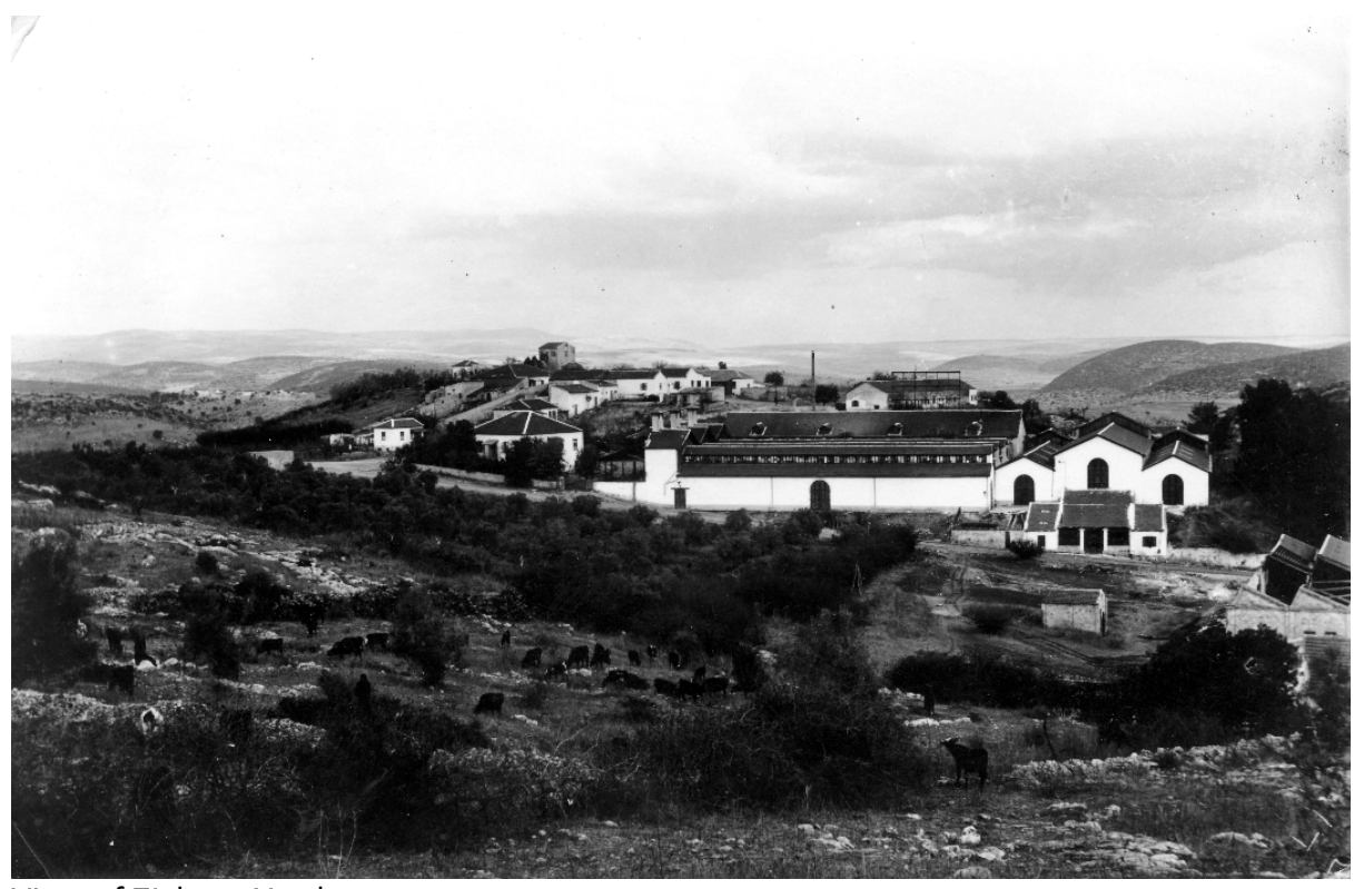
View of Zichron Ya'akov, 1941