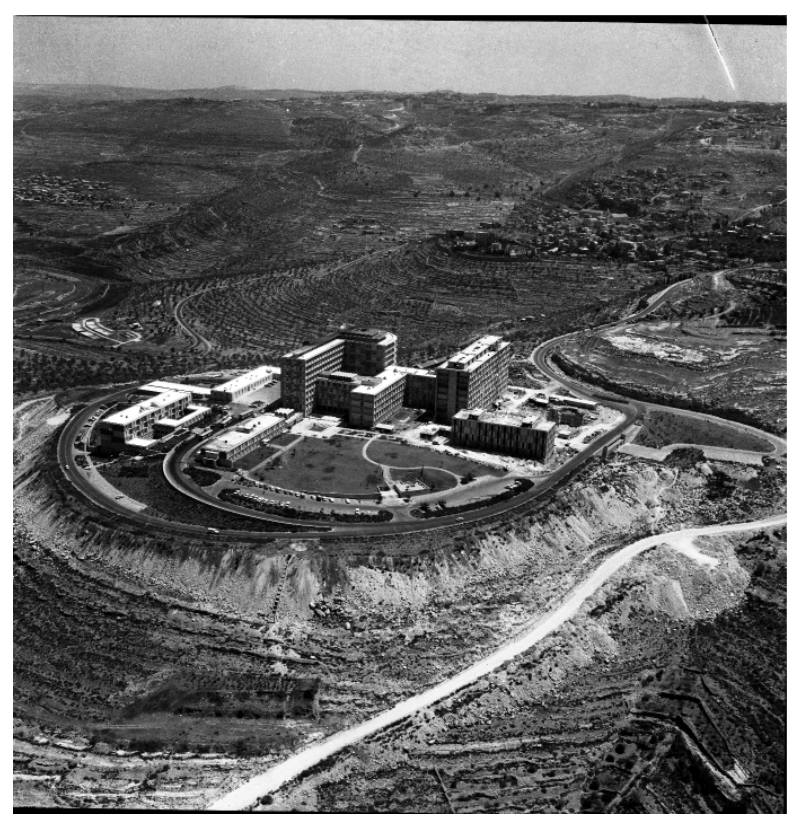
Hadassah Ein Kerem, 1960s