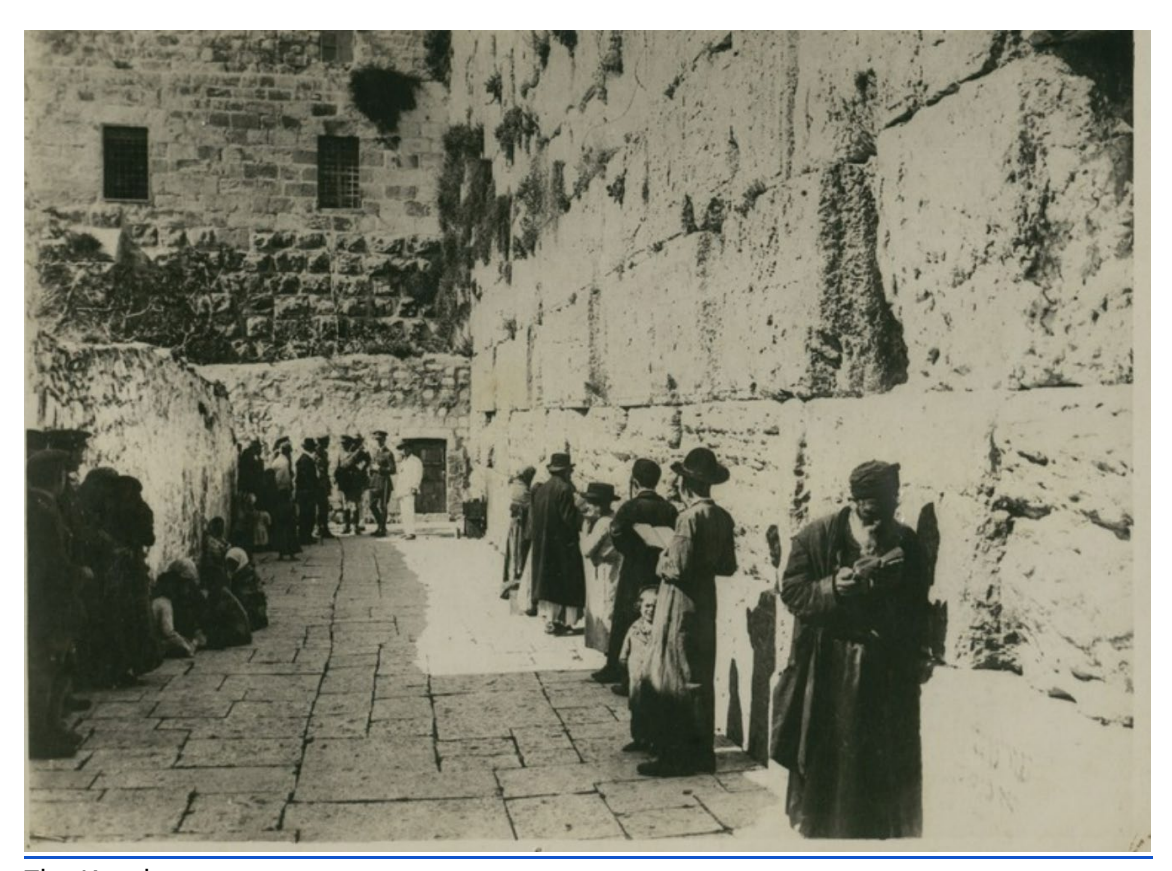
The Kotel, 1918