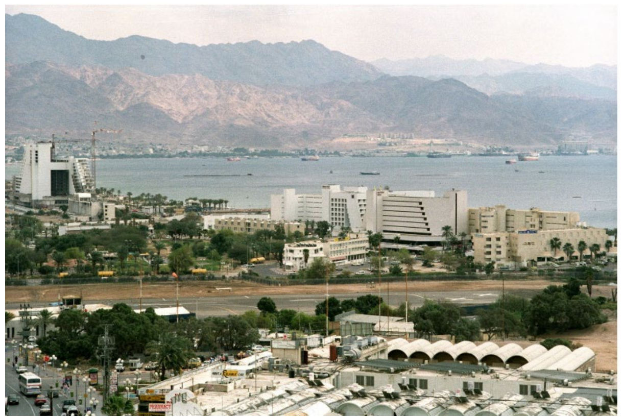
Cold but not in Eilat, 1993