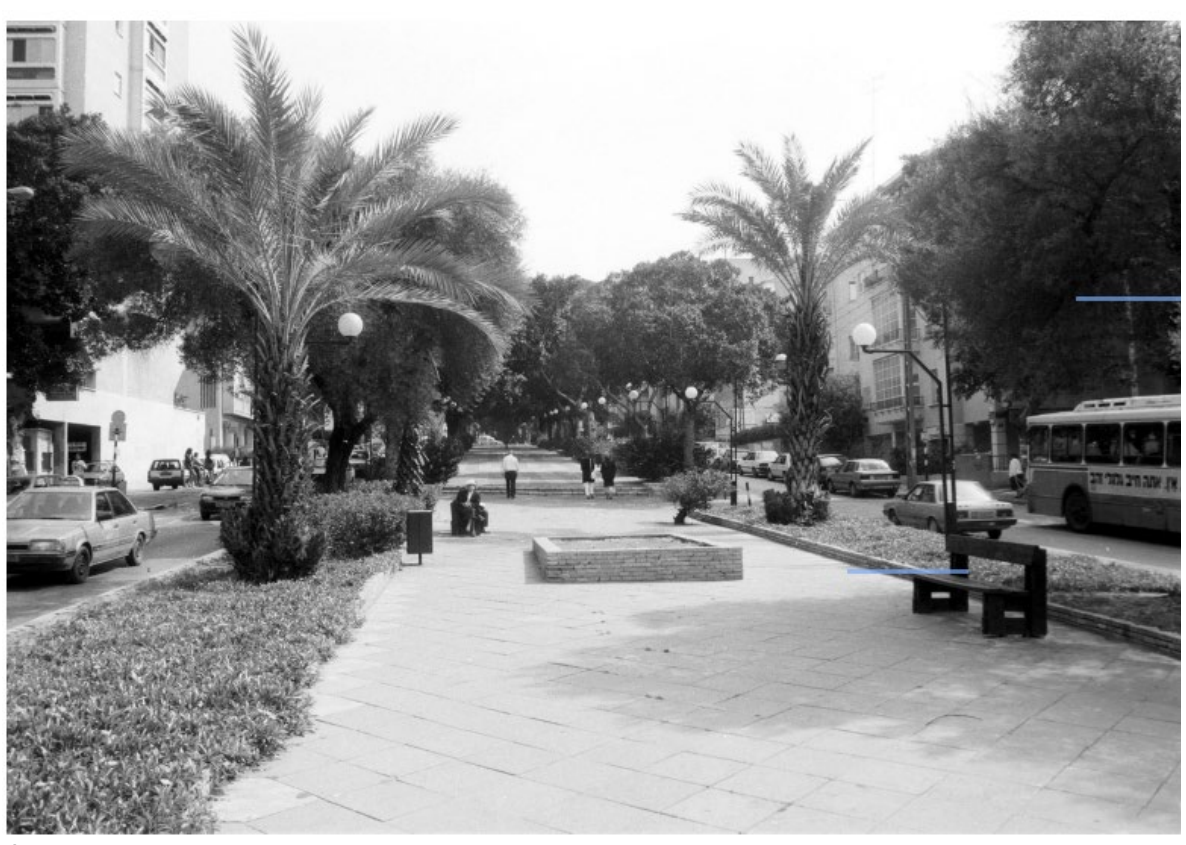
Tel Aviv, 1994