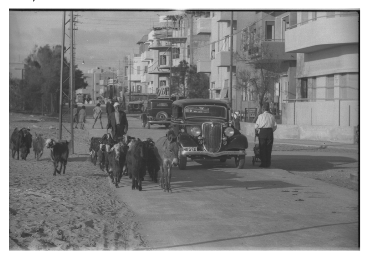
Tel Aviv Street, 1935