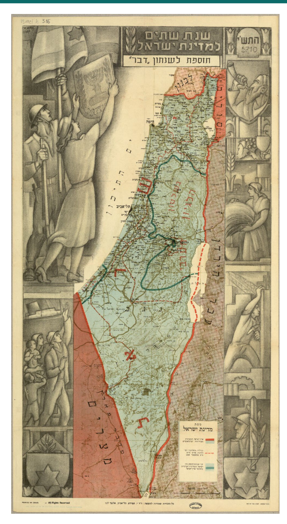
Map of Israel, 1950