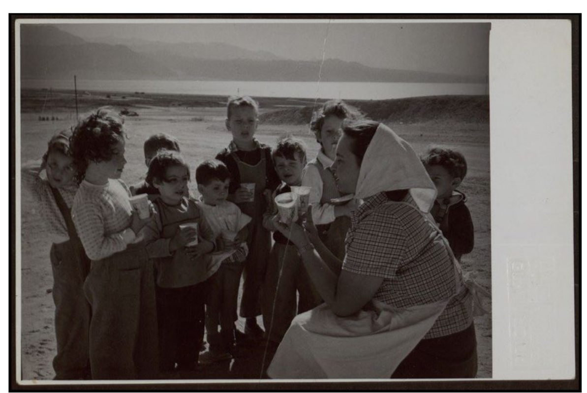
Kindergarten Children in Eilat, 1953